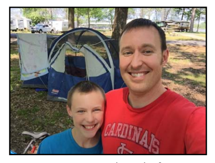
We went on a camping trip for my Passport2Purity weekend. We forgot the sleeping bags, but thankfully we remembered the air mattress.